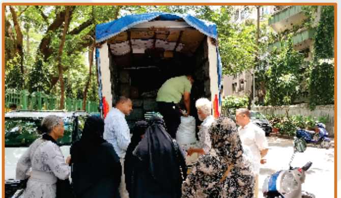
Monthly Ration Distribution for the Deserving Families