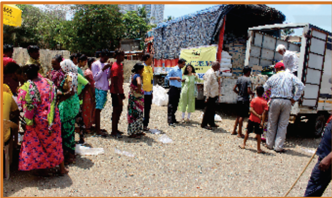
Provided assistance to victims of a devastating fire in Appa pada Malad (E). Partnership with M/s Netscribes Data & Insights Pvt.Ltd.

M/s. NETSCRIBES DATA & INSIGHT PVT. LTD. supported MESCO through CSR initiative in Disaster Relief – Ration Support at Appa pada, Malad (E) in March 2023. The victims of the devastating fire needed urgent support and relief. MESCO distributed ration kits to 800 affected families.