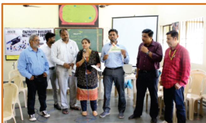
Staff training workshop on Capacity Building was conducted on 18th June, 2022 at MES Crescent English High School, Mumbra