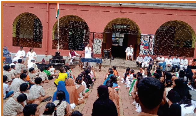
Independence Day program at R.C. Mahim Municipal Urdu School.