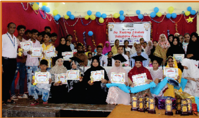
Felicitation Function at R.C. Mahim Municipal Urdu School.