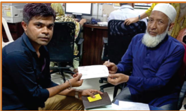
Providing Rs. 30,000/- cheque to a cancer patient supported by M/s. Gravitas Technology Pvt. Ltd.

M/s. LINEDATA - M/s. GRAVITAS TECHNOLOGY PVT. LTD. supported MESCO through CSR initiative in Medical – Life Saving Medical Aid (LSMA)