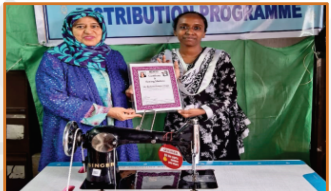
Sewing Machine Distribution to Deserving women to earn livelihood.