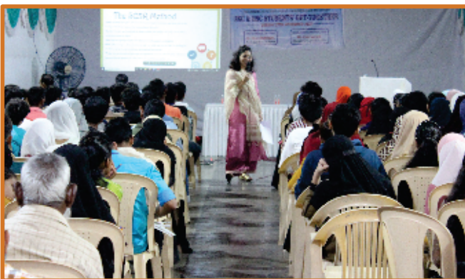
"How to prepare for Exams" Session conducted for SSC & HSC Students.