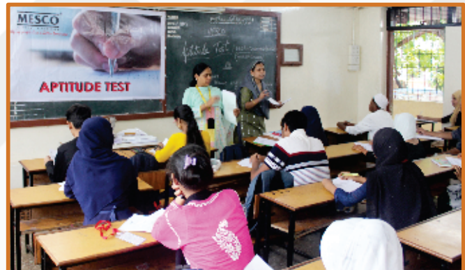
“Aptitude Test” was conducted on 10th May at Anjuman-I-Islam girls school, Bandra for EAS Students.