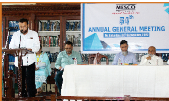
54th Annual General Meeting at Karimi Library.