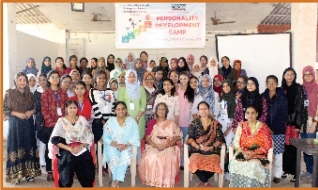
Personality Development Camp for girls Graduating Students held at Yusuf Meherally Centre.