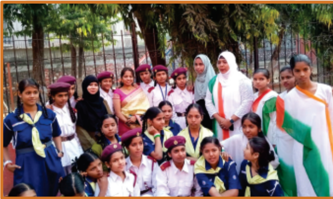
Republic day program at R.C. Mahim Municipal Urdu School.