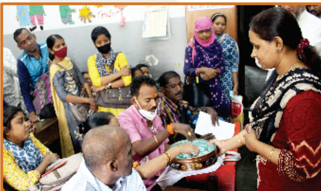
Drawing lots at Six months Dialysis forms Distribution.