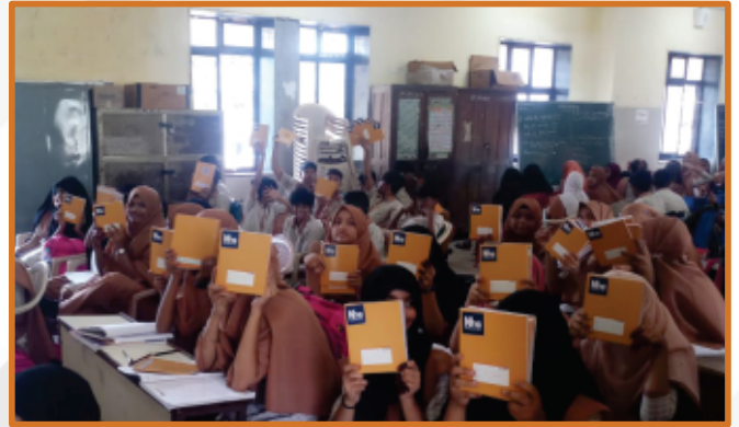
Books Distribution at R.C. Mahim Municipal Urdu School

M/s. NETSCRIBES DATA & INSIGHT PVT. LTD. supported MESCO through CSR initiative in Disaster Relief – Ration Support at Appa pada, Malad (E) in March 2023. The victims of the devastating fire needed urgent support and relief. MESCO distributed ration kits to 800 affected families.