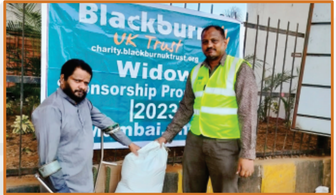
Ration Distribution for poor families sponsored by Blackburn, UK Trust.