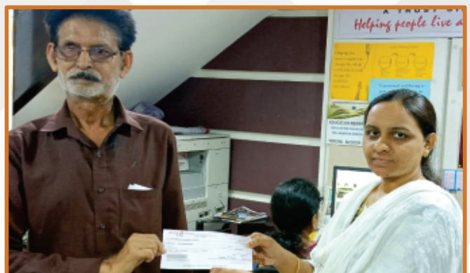
Medical Prog. executive giving a cheque of Rs. 50,000/- to a cancer patient on behalf of M/s. Nadiadwala Grandsons Entertainment Pvt.Ltd.