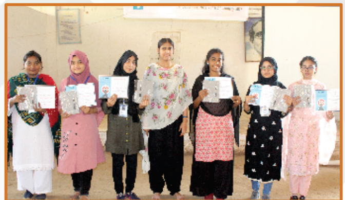
Presented Certificate and Gifts to students at Personality Development Camp.