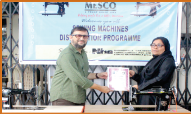
Sewing Machine Distribution to Deserving women to earn livelihood

M/s. NADIADWALA GRANDSONS PVT. LTD. supported MESCO through CSR initiative in various causes such as Medical Aid, Education Aid, Education Adoption Scholarship, Ration Kit, Sewing Machine, Medical-LSMA, Medical-Dialysis, General Aid & General Funds. These generous acts are serving as a lifeline for individuals and families facing economic challenges.