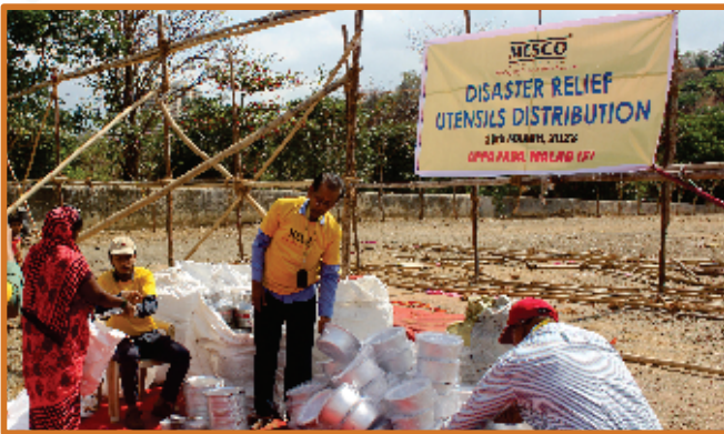
Distributed 100 Utensil Kits to the affected slum victims of a huge fire at Appa pada, Malad (E) in March 23.